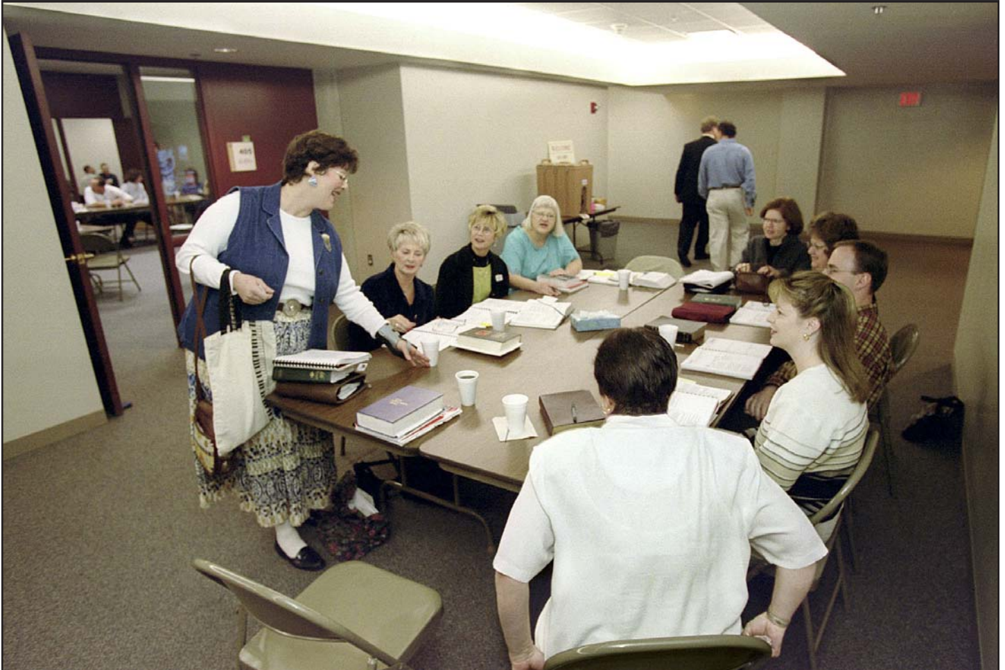
September is Open House Month for the United Methodist Church and a time for Sunday school classes to reach out for new members. The United Methodist Board of Discipleship has prepared a list of ideas to help plan for this fall using the theme of Open House to generate enthusiasm for Christian education in congregations.

California-Nevada Annual Conference of The United Methodist Church