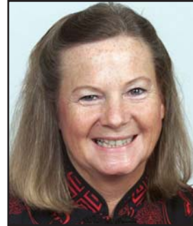
Bishop Mary Ann Swenson

in 1979. The suits were brought after the California legislature reopened the state's statute of limitations for these kinds of cases in 2003.